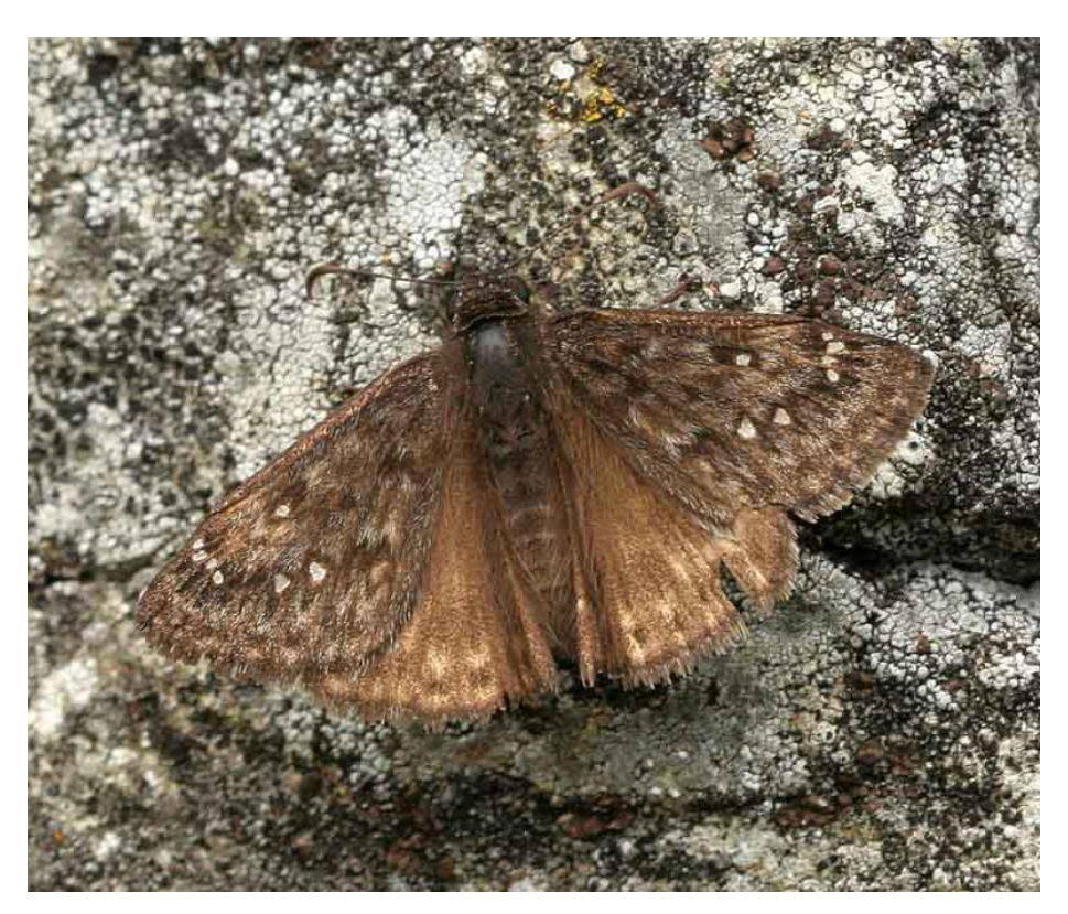
The Propertius Duskywing, one of the rare species at Fort Rodd Hill