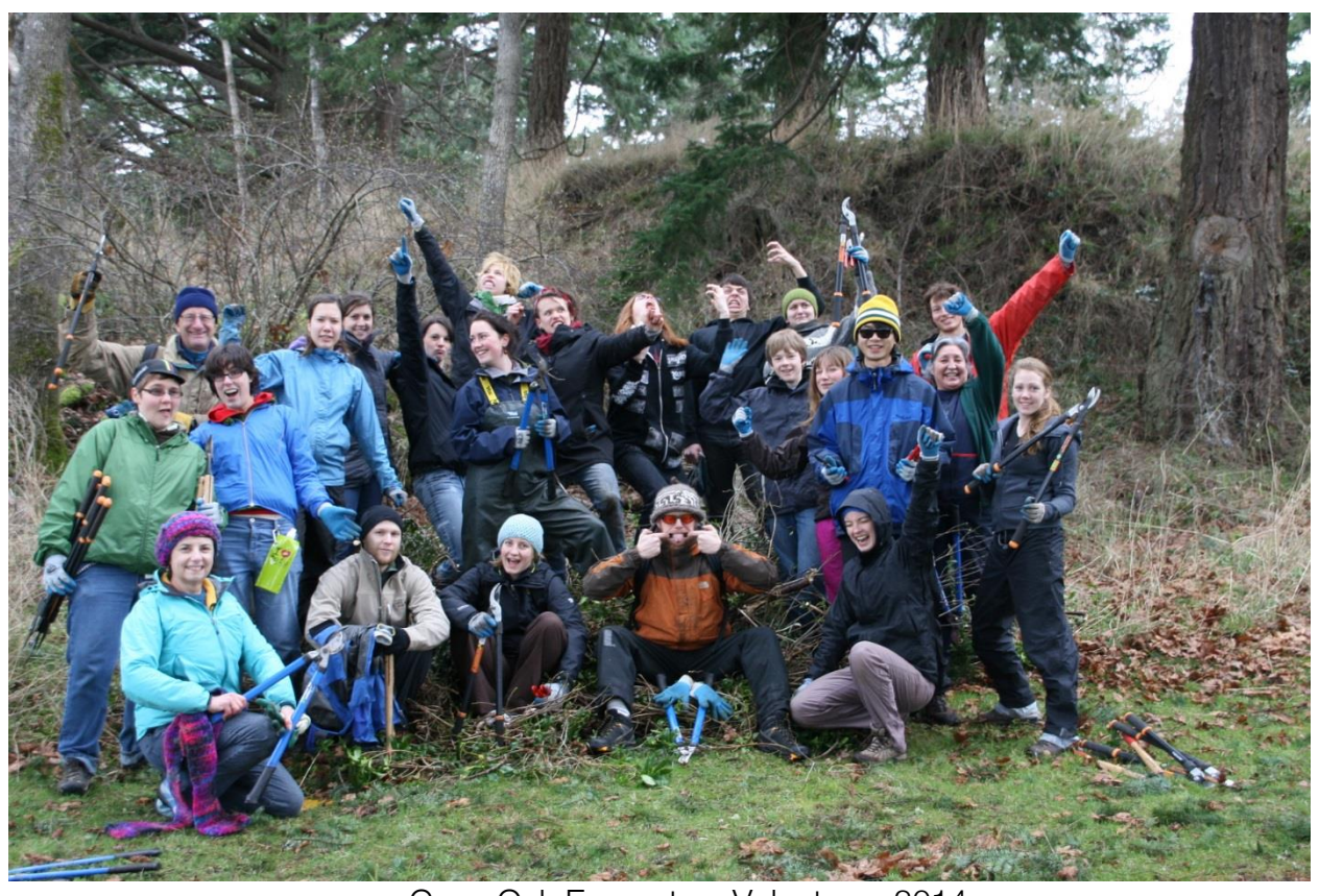
Garry Oak Ecosystem Volunteers 2014

Parks Canada works to restore Garry Oak and associated ecosystems on 54 hectares of land in and around the historic sites. These ecosystems are some of the rarest in Canada and are disappearing fast due to habitat loss from development and the encroachment of invasive species. More than 100 rare or endangered plant and animal species live in these beautiful ecosystems. Our volunteer program aims to improve public awareness of these rare ecosystems, provide valuable experience and knowledge and engage people in a fun and social way.